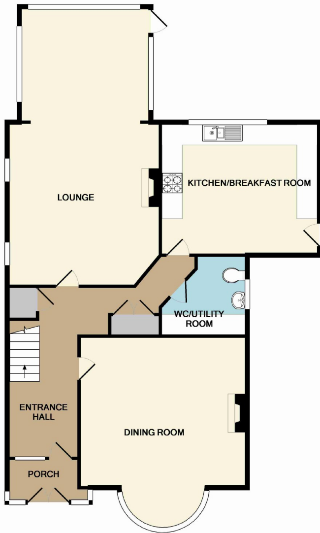
GROUND FLOOR APPROX. FLOOR AREA 1103 SQ.FT. (102.5 SQ.M.)