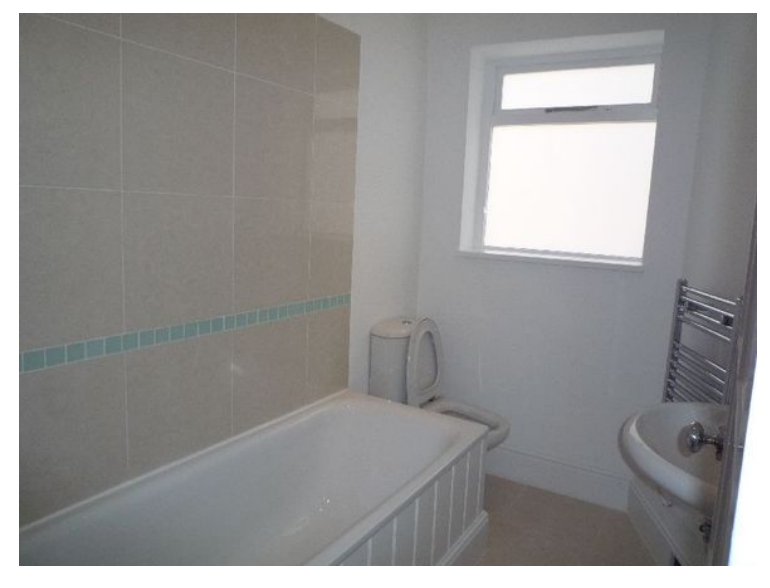
Broomfield Estates give notice to anyone reading these particulars that: (i) these particulars do not constitute part of an offer or contract; (ii) these particulars and any pictures or plans represent the opinion of the author and are given in good faith for guidance only and must not be construed as statements of fact; (iii) nothing in the particulars shall be deemed a statement that the property is in good condition otherwise; we have not carried out a structural survey of the property and have not tested the services, appliances or specified fittings.