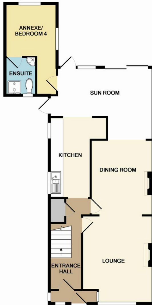
GROUND FLOOR APPROX. FLOOR AREA 742 SQ.FT. (68.9 SQ.M.)