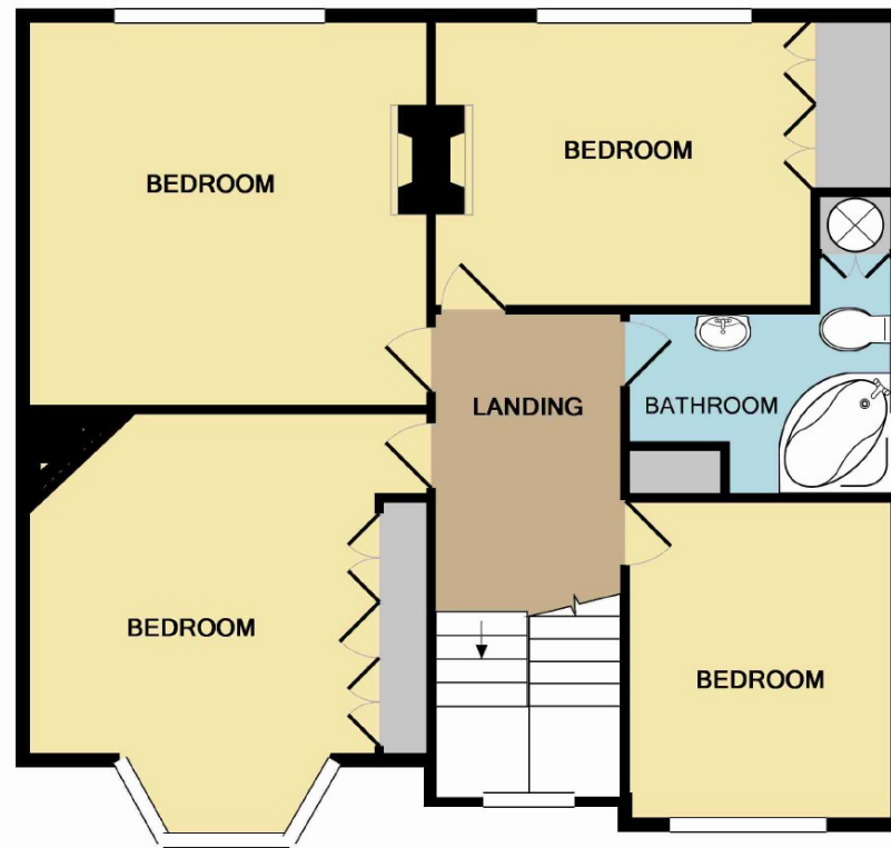
1ST FLOOR APPROX. FLOOR AREA 799 SQ.FT. (74.2 SQ.M.)

TOTAL APPROX. FLOOR AREA 1832 SQ.FT. (170.2 SQ.M.)