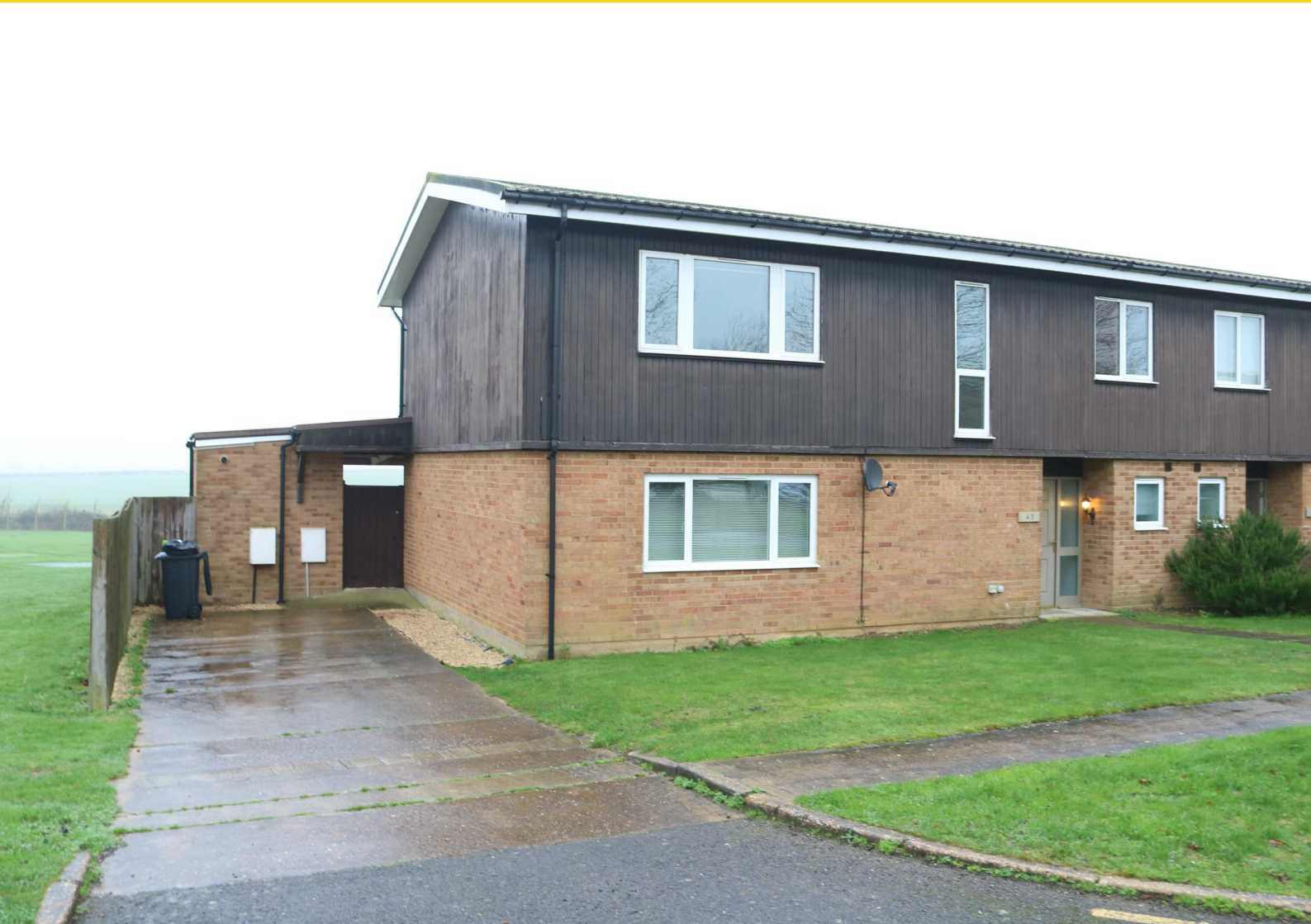
47 The Crescent, Caldecott Northamptonshire NN9 6AU