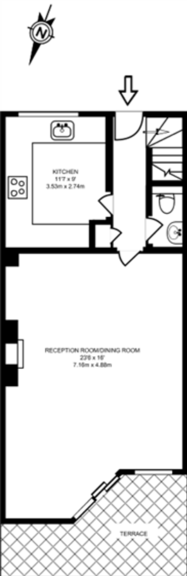
GROUND FLOOR GROSS INTERNAL FLOOR AREA 538 SQ FT/50.01 SQ M