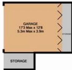
GROUND FLOOR APPROX. FLOOR AREA 1860 SQ. FT. (172.8 SQ. M.)