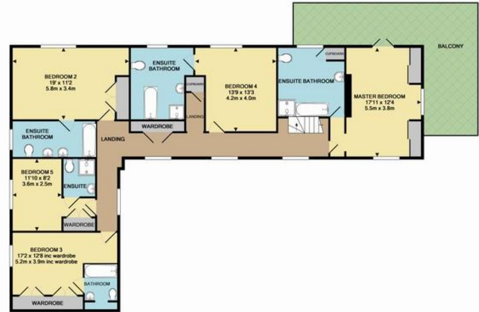
1ST FLOOR APPROX. FLOOR AREA 1591 SQ. FT. (147.8 SQ. M.)

TOTAL APPROX. FLOOR AREA 3451 SQ. FT. (320.6 SQ. M.) (While every attempt has been made to ensure the accuracy of the floor plan contained here, measurements of doors, windows, stairs and any other items are approximate and no responsibility is taken for any error, omission, or mis-statement. This plan is for illustrative purposes only and should be used as such by any prospective purchaser. The services, systems and appliances shown have not been tested and no guarantee as to their operation or efficiency can be given. Made with Mahoney 02/16