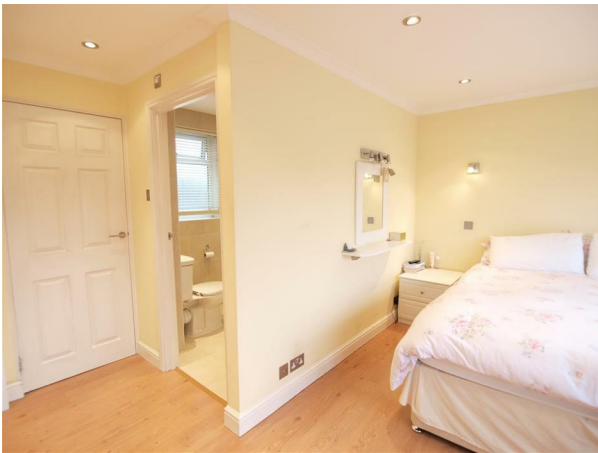
BEDROOM 1:- 16'5 x 14'3