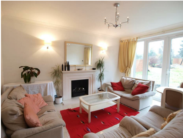
TELEVISION ROOM:- 14'5 x 12'6