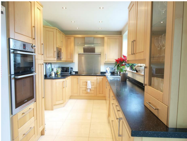
KITCHEN:- 14'11 x 7'10