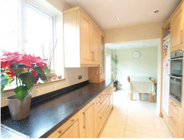
BREAKFAST ROOM:- 8'8 x 8