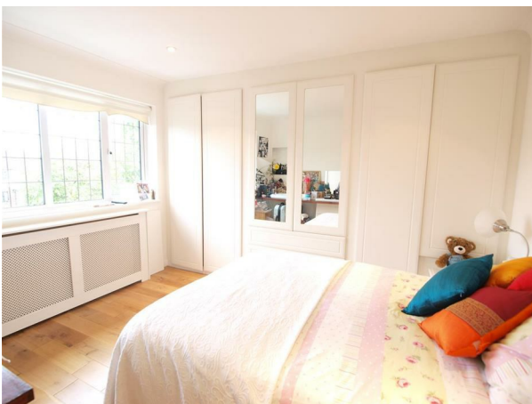
BEDROOM 2:- 14'5 x 12'6