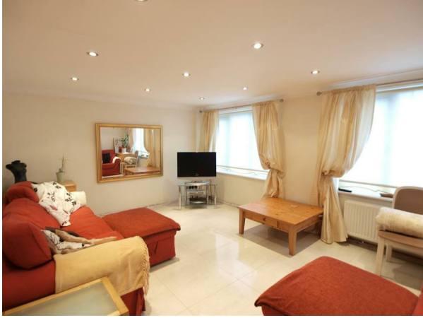
LIVING ROOM:- 16'5 x 15'9