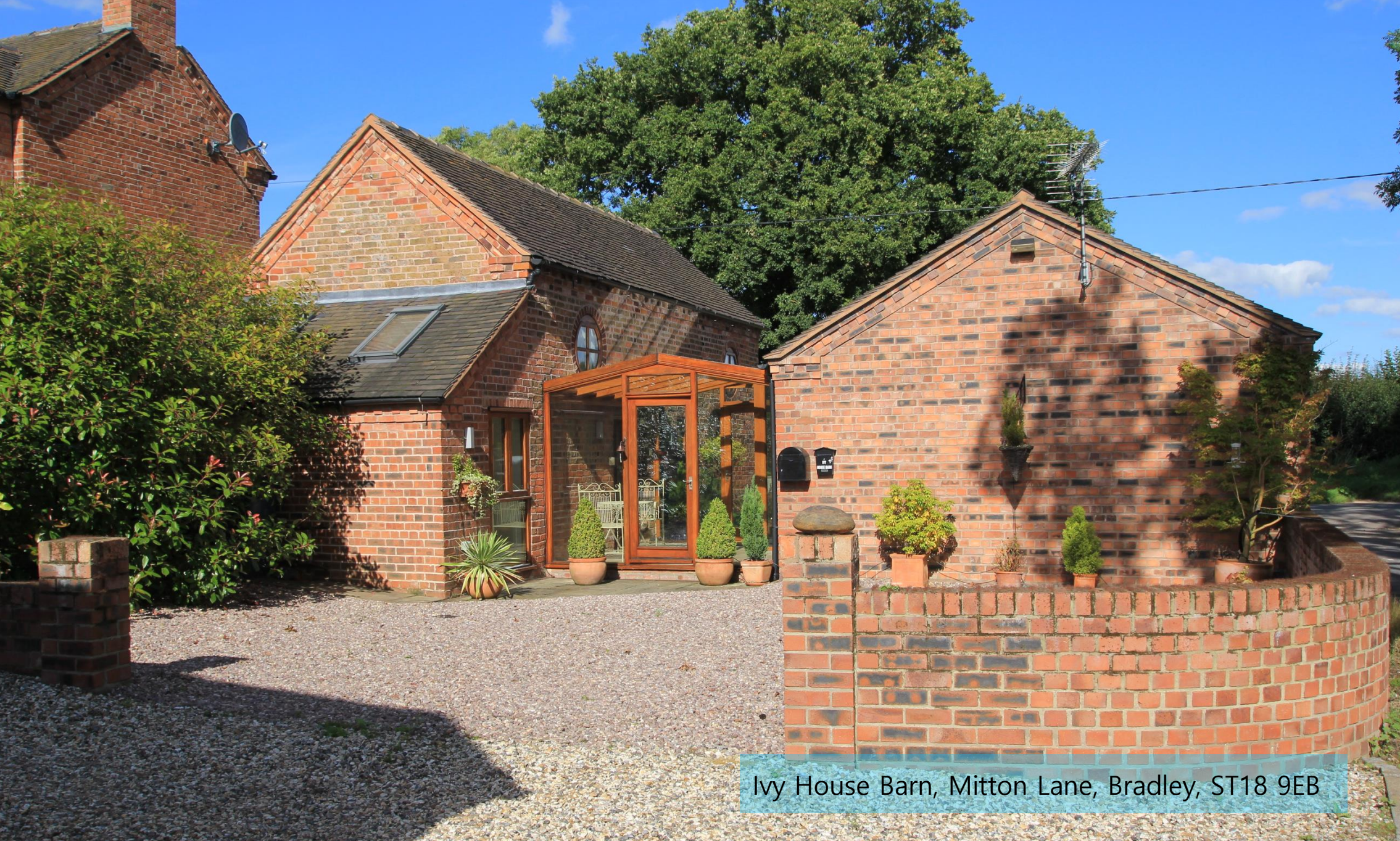
Ivy House Barn, Mitton Lane, Bradley, ST18 9EB