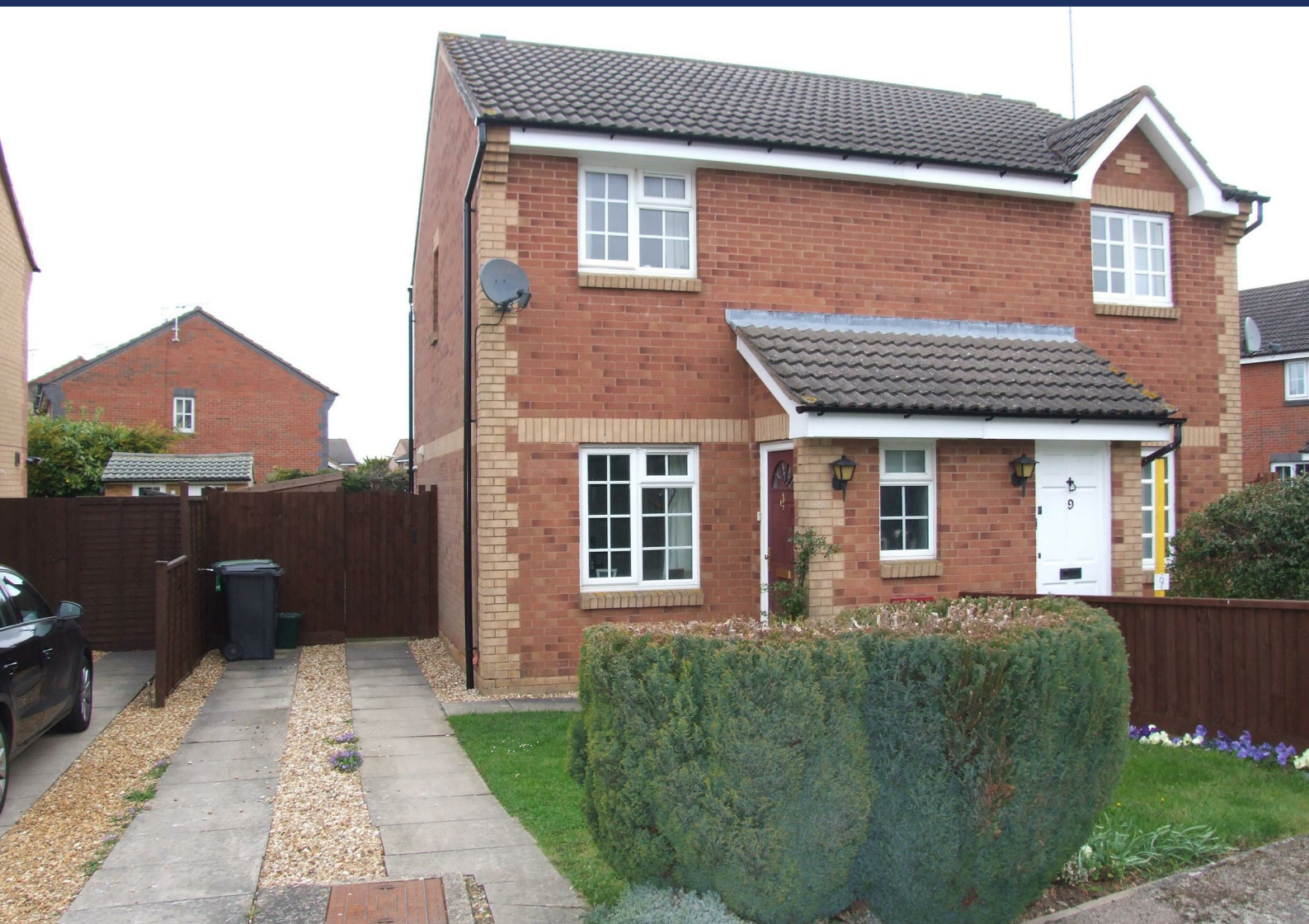
7 Betony Walk, Rushden Northamptonshire NN10 0TL